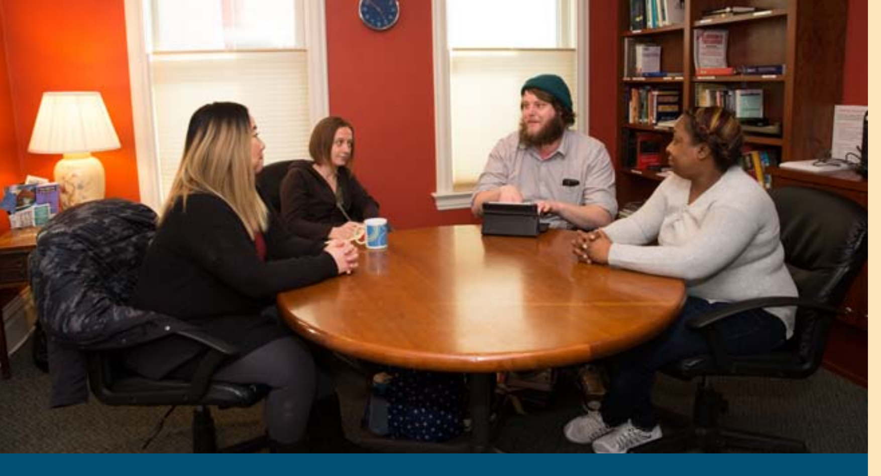
"Walk-In serves the local community's mental health needs in times of crisis or where there is no place else to go. Thank you!"-Donor