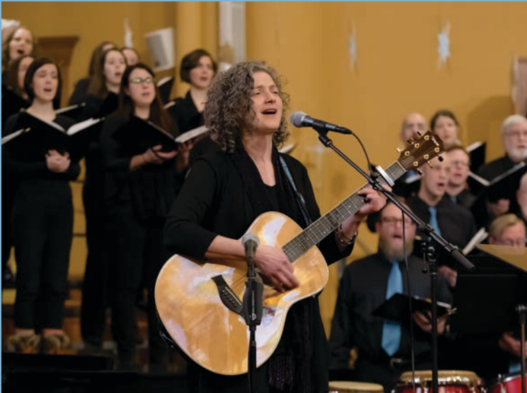
VocalPoint Chorus Concert